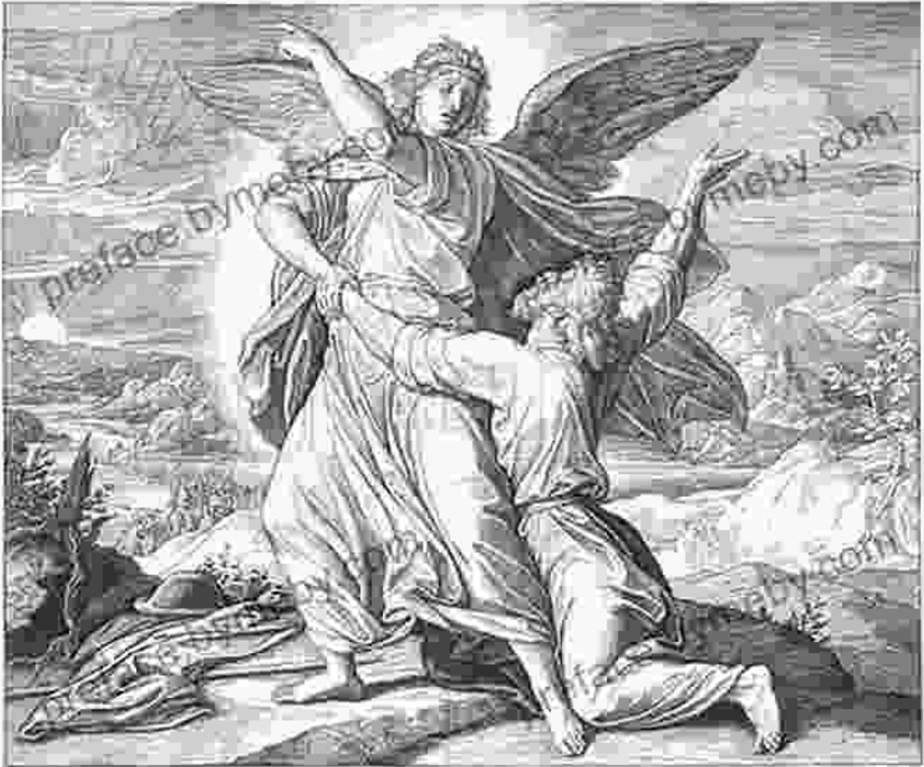
JACOB WRESTLING WITH THE ANGEL OF THE LORD

And the angel said unto him, Rise up, and thou shalt be blessed. And he said, Wherefore sayest thou so? And he said, Thou art Jacob. And he said, Yes. And he said, Thy name shall be called Israel: for thou hast striven with the angel, and thou art victorious. And he said, Wherefore sayest thou so? And he said, Thou art Jacob. And he said, Yes. And he said, Thy name shall be called Israel: for thou hast striven with the angel, and thou art victorious.