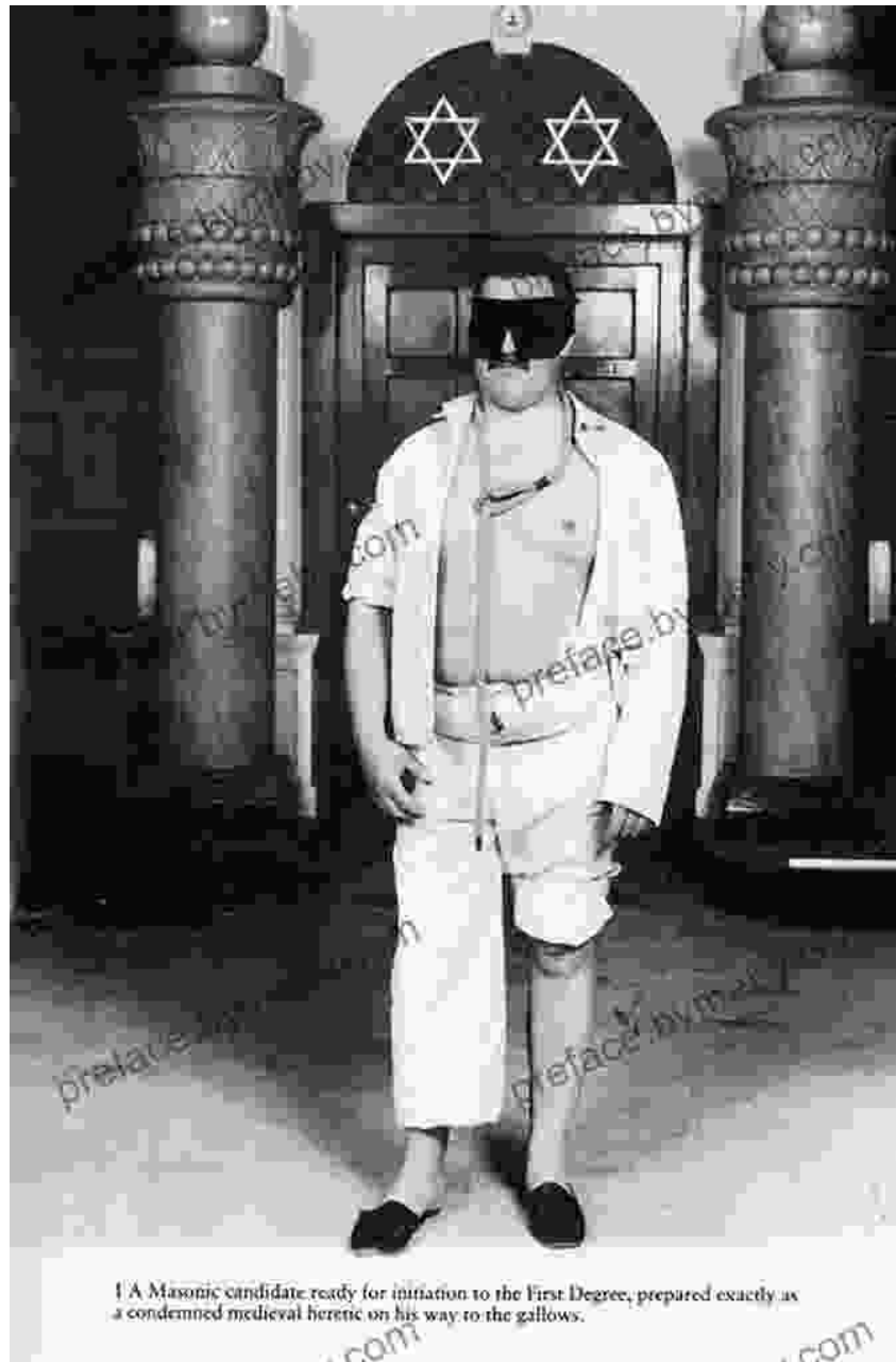
! A Masonic candidate ready for initiation to the First Degree, prepared exactly as a condemned medieval heretic on his way to the gallows.

Freemasonry, an ancient and enigmatic brotherhood, has captivated the imaginations of seekers of wisdom and enlightenment for centuries. At its core, Freemasonry is a journey of self-discovery, inviting its initiates to unravel the mysteries of the universe and unlock their true potential. In "The Masonic Initiate's Guide to Light," renowned Masonic scholar and