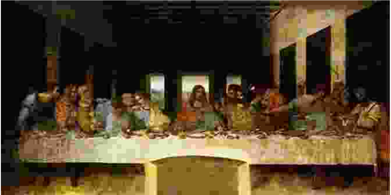
The Last Supper, c. 1495-1498

The Last Supper, a monumental fresco adorning the wall of the Convent of Santa Maria delle Grazie in Milan, depicts the final meal shared by Jesus and his disciples before his crucifixion. Leonardo's masterful use of perspective and composition creates a sense of grandiosity and intimacy. Each apostle is captured in a unique pose and expression, reflecting their reactions to Jesus' announcement of his impending betrayal.