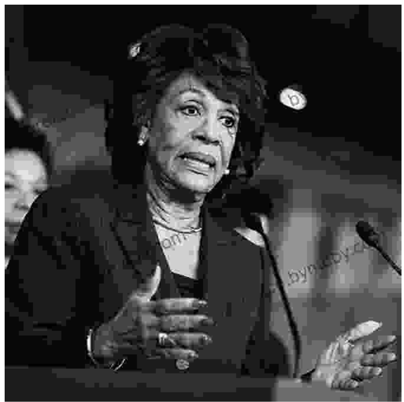
A Voice for the Voiceless in Congress

In the 1960s, Waters emerged as a prominent figure in the Civil Rights Movement. She joined the Congress of Racial Equality (CORE) and participated in numerous protests and voter registration drives, fighting tirelessly for racial justice and equality.