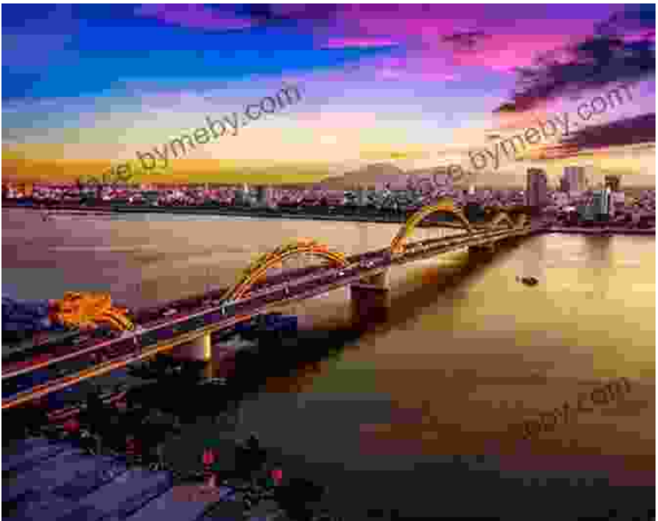
Hoi An: An Ancient Town of Lanterns and History